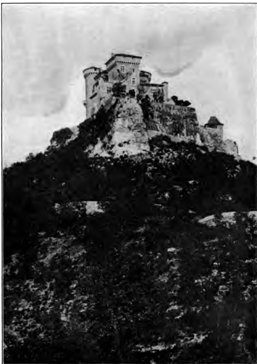
THE CHATEAU OF CABRIÈRES Seen from the Highway