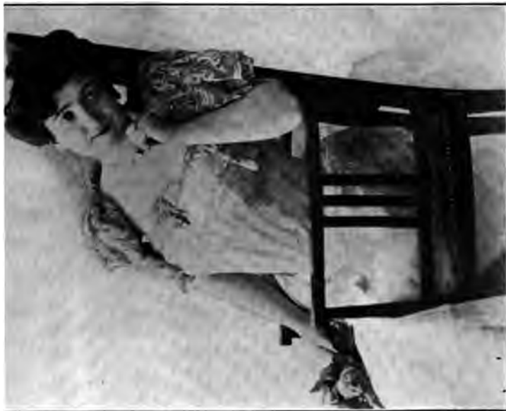
CALVÉ AS SAPPHO