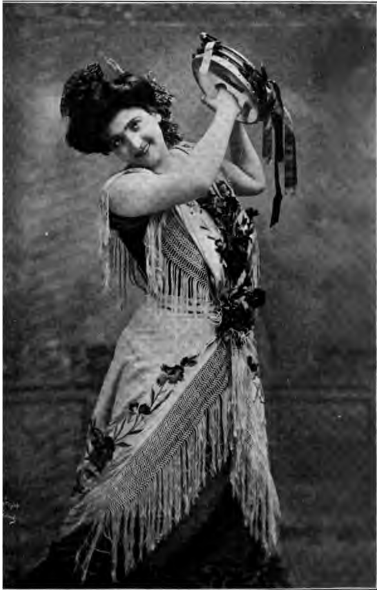
CALVÉ AS CARMEN