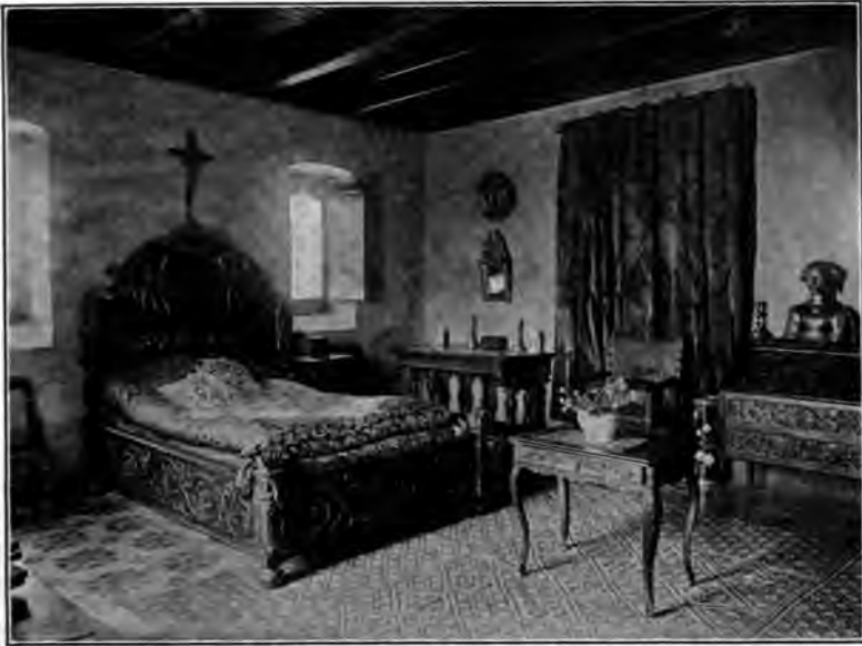
A ROOM IN THE CHATEAU OF CARRIÈRES