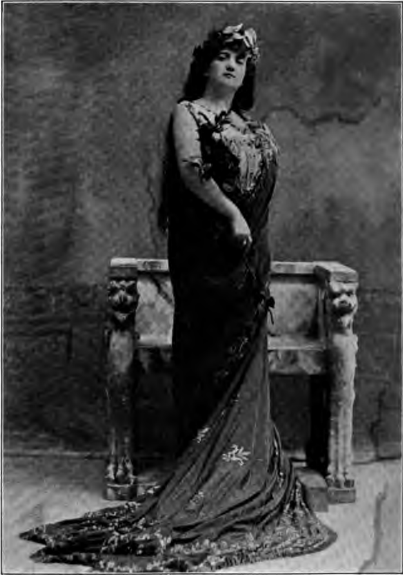
CALVÉ AS MESSALINE