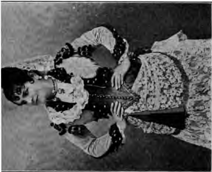
GALLI-MARIÉ, CREATOR OF CARMEN