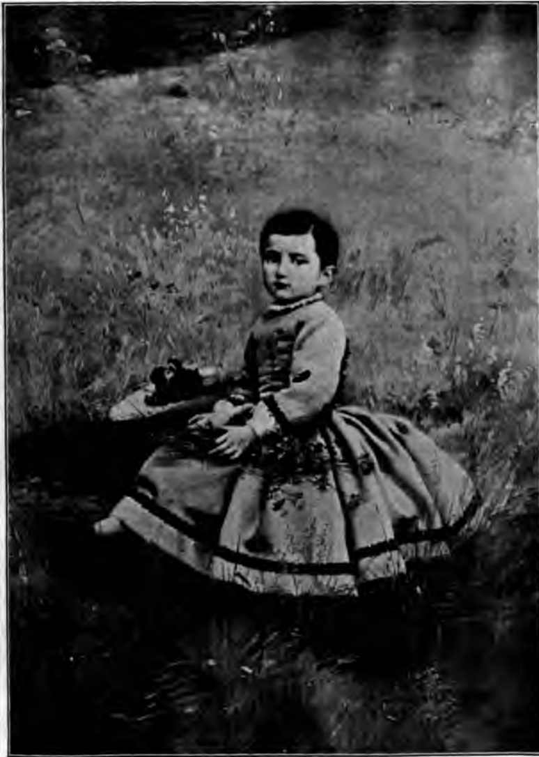
EMMA CALVÉ AT FIVE