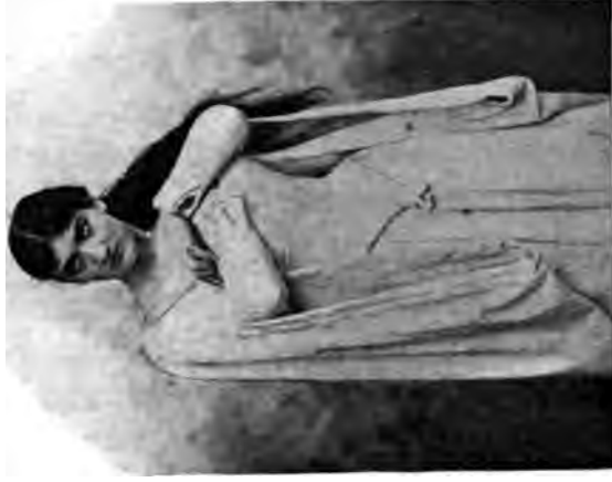
CALVÉ IN "LE CHEVALIER JEAN"