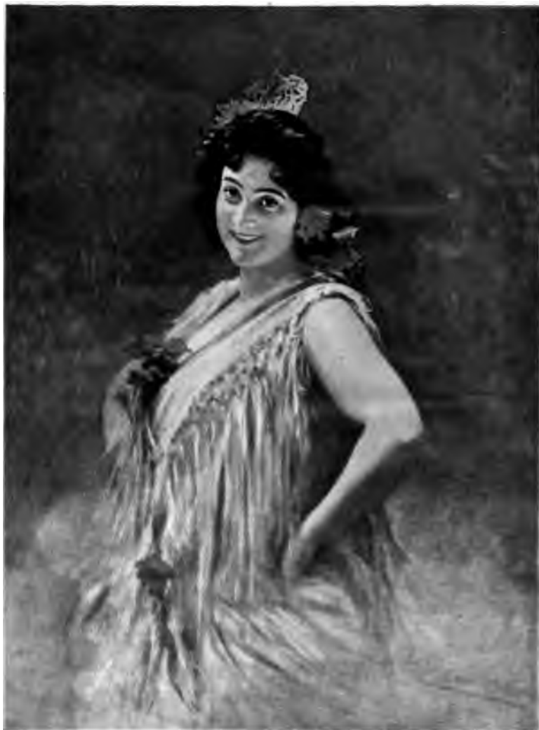
From the Original Painting by Théobald Chartran in possession of Knoedler & Co.