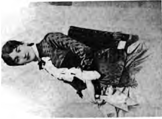
EMMA CALVÉ DURING HER STUDENT YEARS IN PARIS