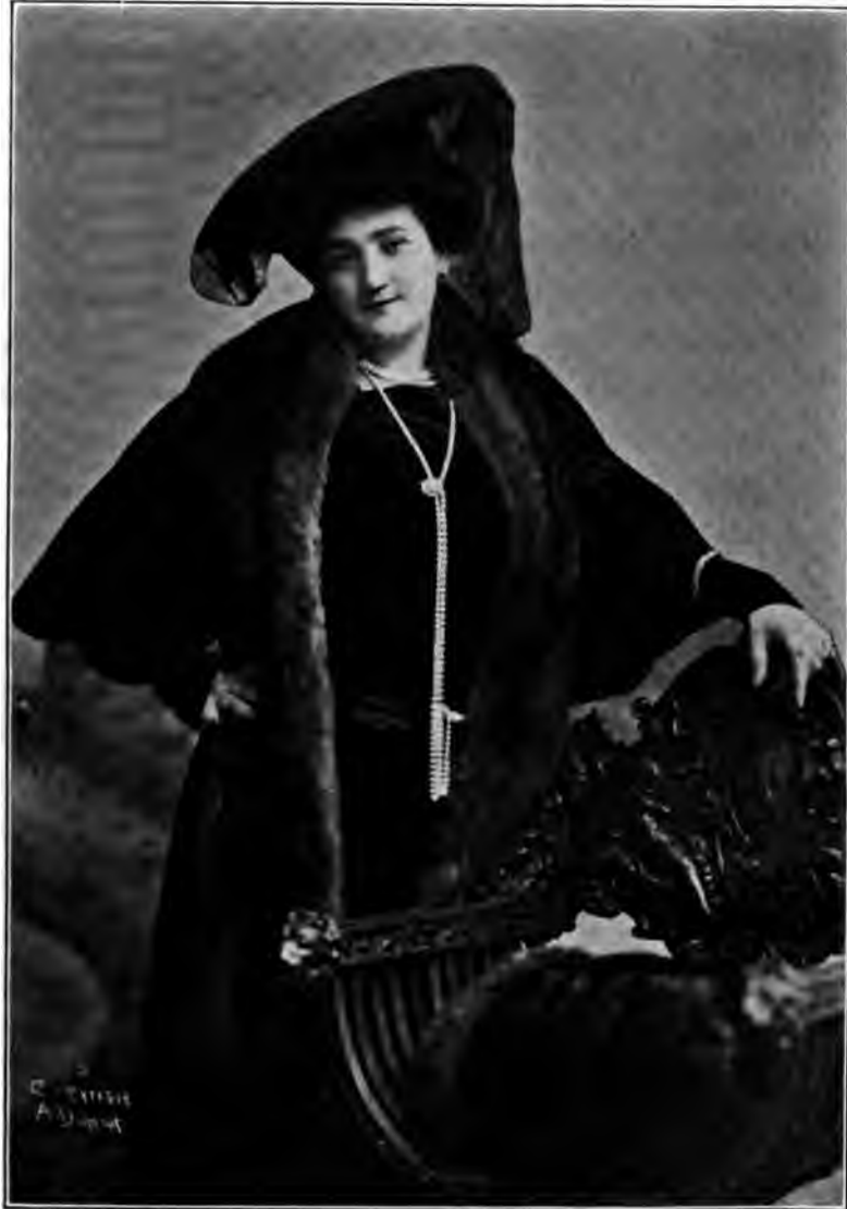
EMMA CALVÉ ON A CONCERT TOUR IN THE UNITED STATES