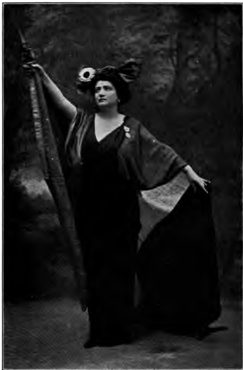
CALVÉ SINGING THE "MARSEILLAISE"