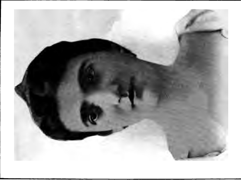
EMMA CALVÉ AT TWENTY