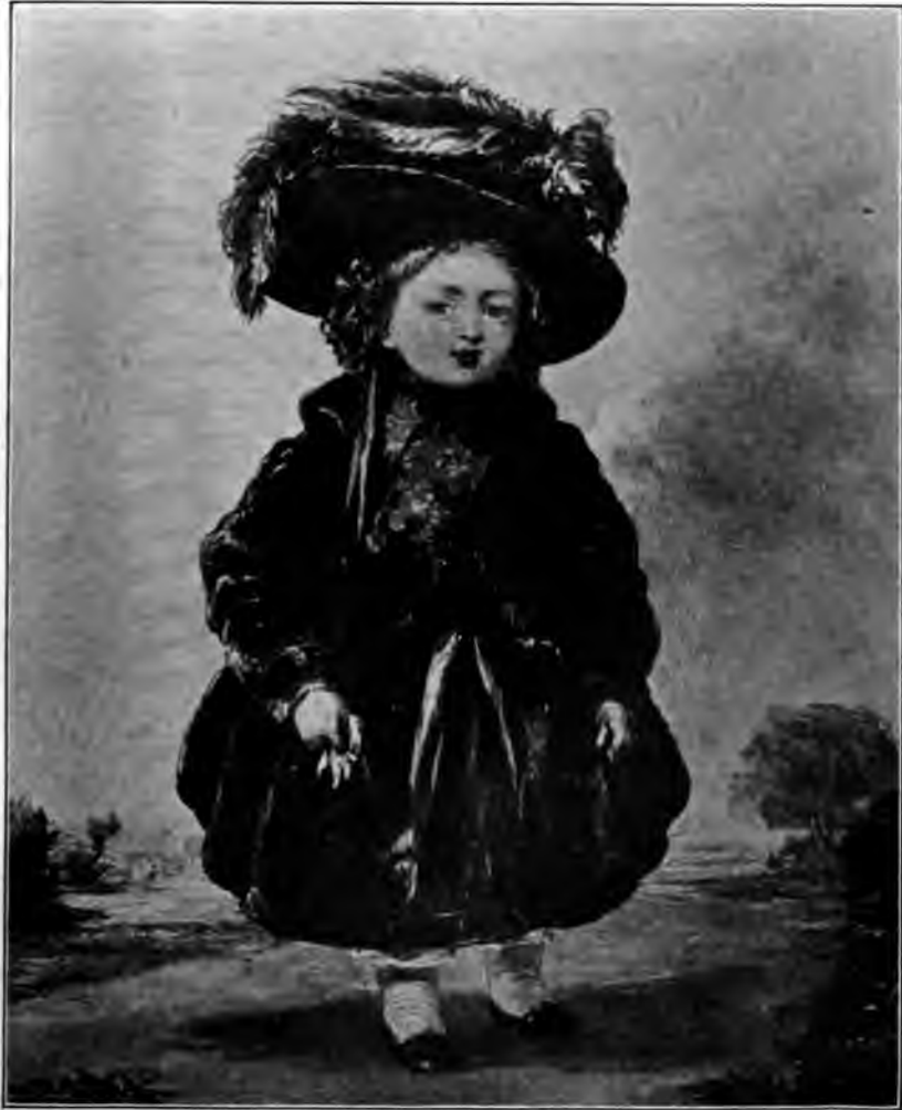
QUEEN VICTORIA AT FIVE