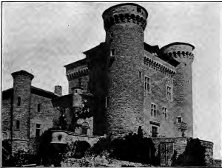
THE CHATEAU OF CARRIÈRES