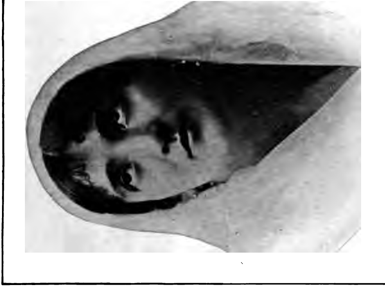
CALVÉ AS SANTUZZA