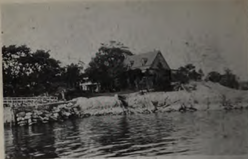
"The Bungalow" from the water.