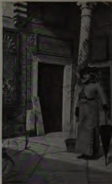
At the Bardo Palace.