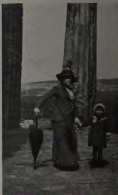
In Sicily. Ella Wheeler Wilcox with godchild.