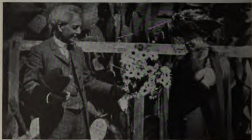
Luther Burbank and Ella Wheeler Wilcox.