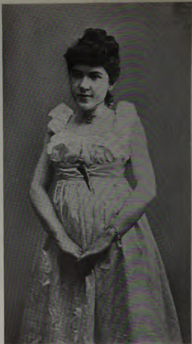
This is the gown she wore when she recited "The Birth of the Opal" at Mrs. Frank Leslie's salon. She tells us that it was her one and only attempt at recitation in public, and that she was convulsed with mirth when an imitation of it was given later.