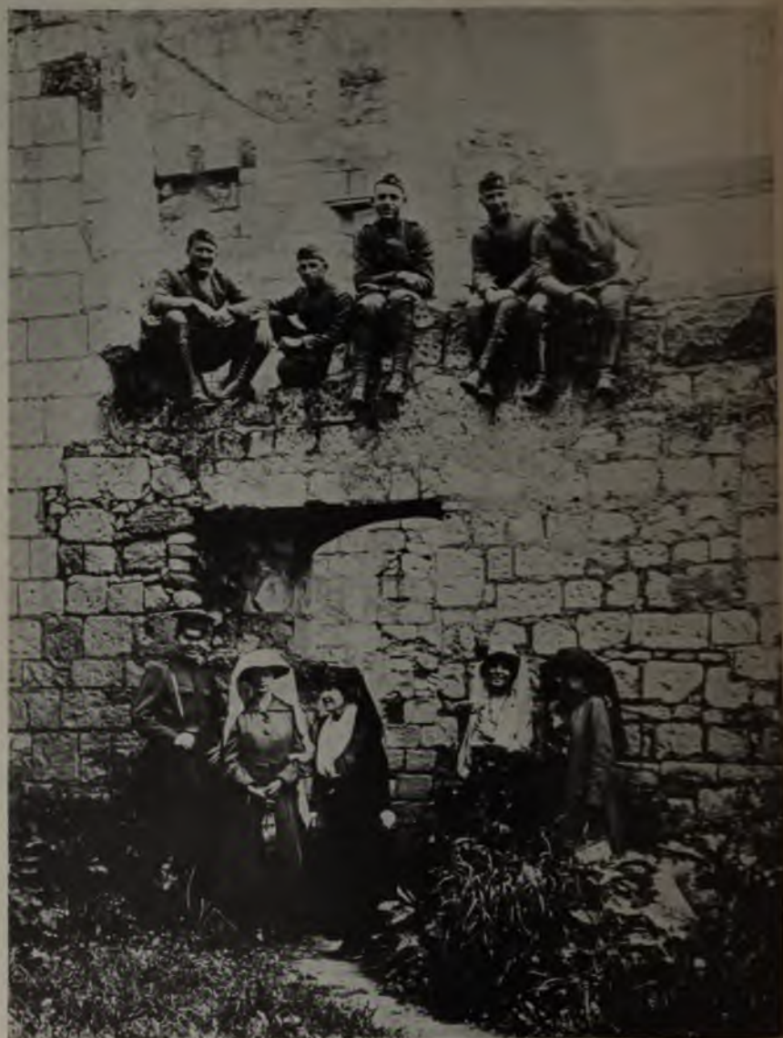
Here she is in the courtyard of an old French château, surrounded by her fellow workers and by the soldiers into whose lives she was able to bring happiness. She is still receiving wonderful communications from the husband who has been here through many incarnations, as his messages from beyond the grave have proved to her complete satisfaction.