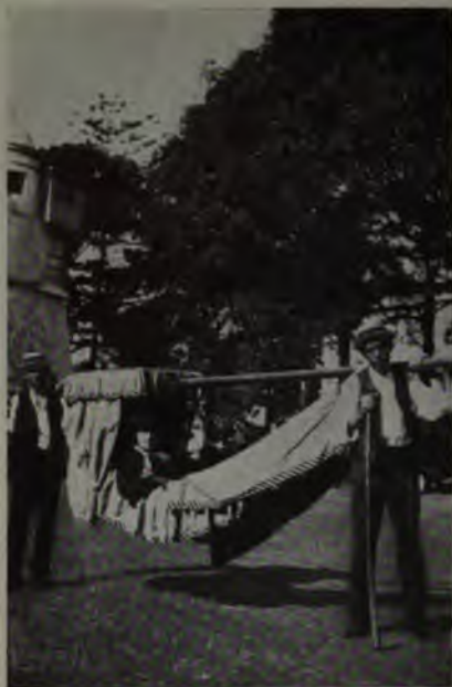
On the Island of Madeira.