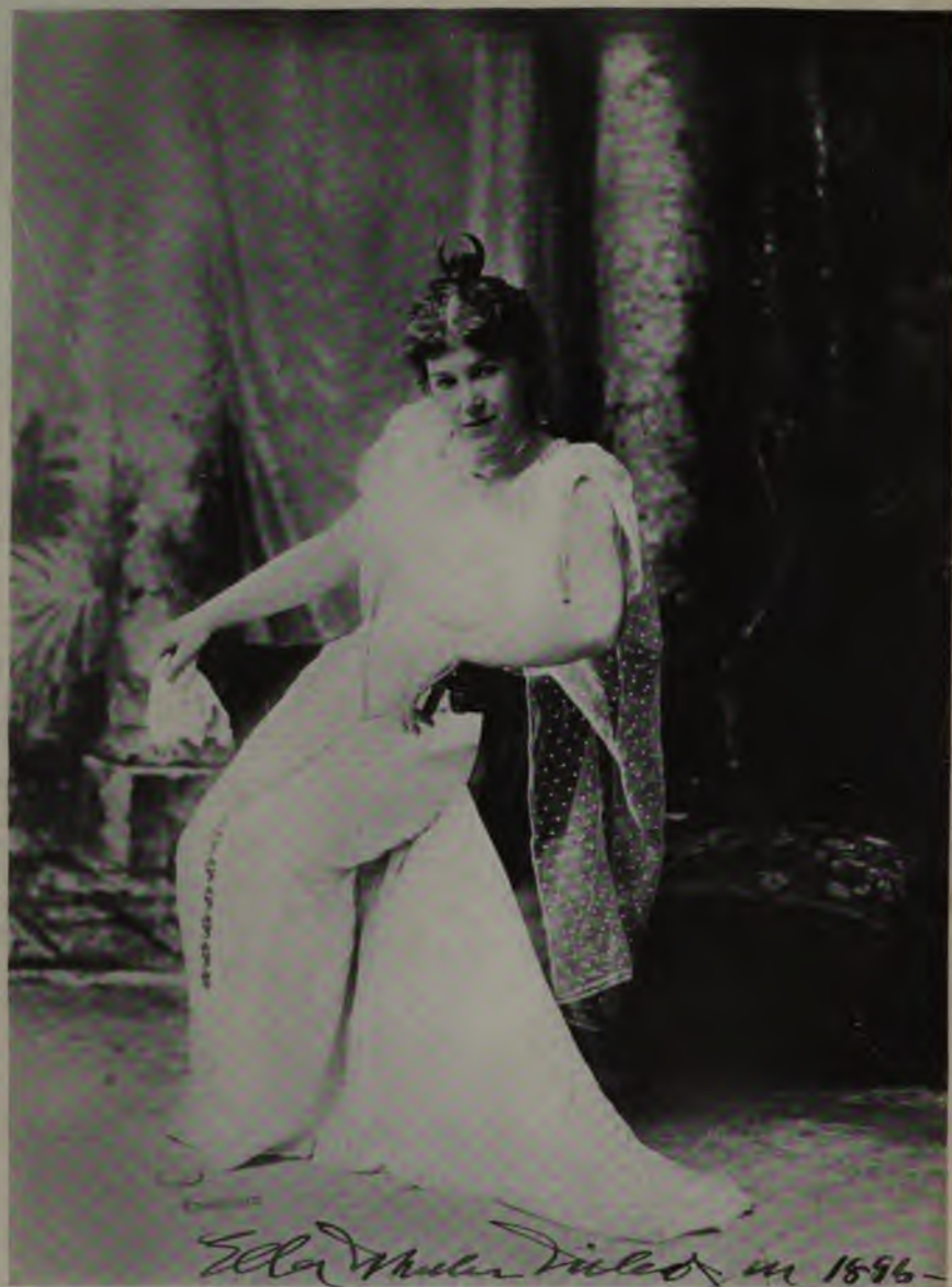
ELLA WHEELER WILCOX