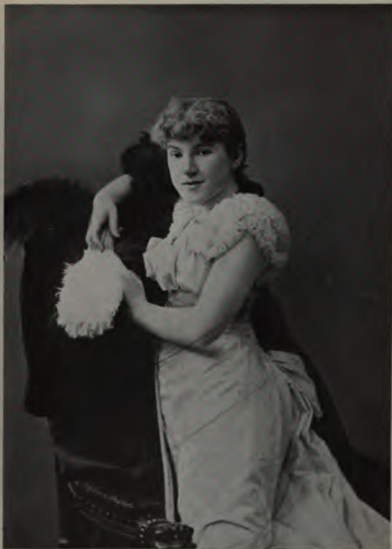
But their first real home was the little New York apartment, which soon became a center for the most distinguished figures in the literary circles of the period. Here is Ella Wheeler Wilcox as she looked in those intoxicating days of congenial society.