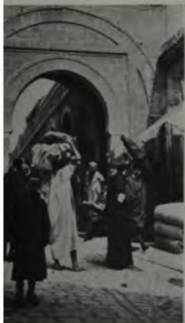
nis at the Gate of the Bey—April,