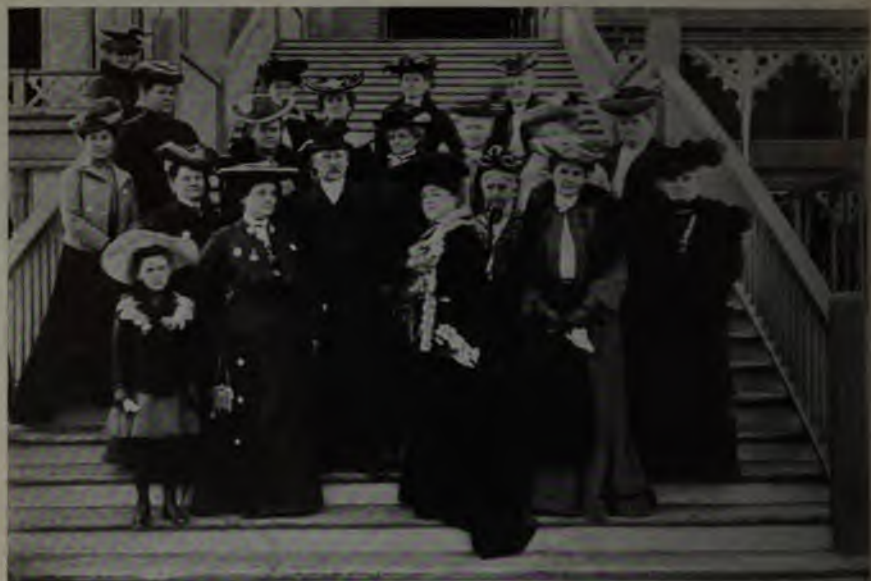
At Salt Lake City. Ella Wheeler Wilcox with a group of Mormon ladies and an Elder.