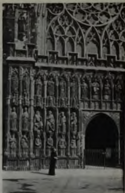
Before a great cathedral.